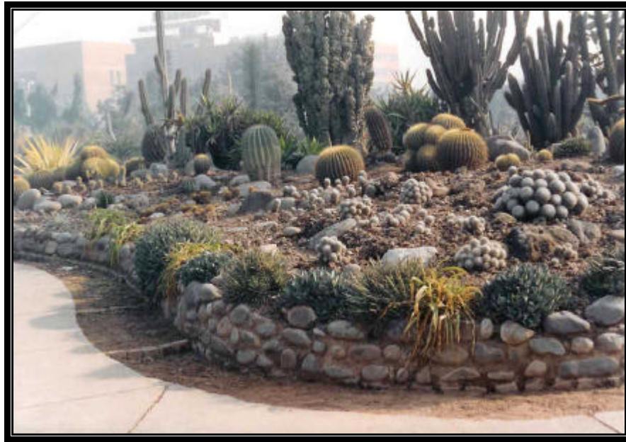
Front view of Rockery I (with plants numbered ,in conformity with text, as follows on a transparent covering)