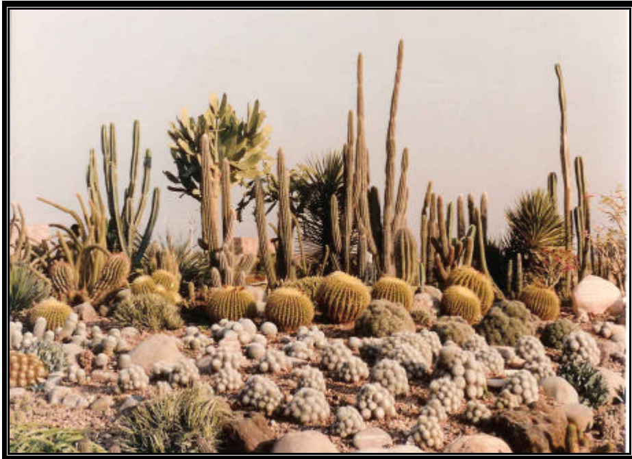
Rear view of Rockery I