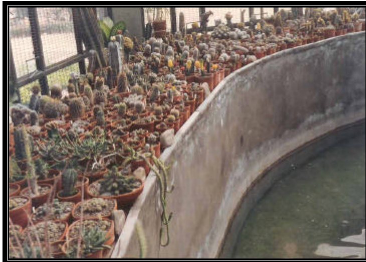
Within Display Glass House

other genera. Several bromeliad species also add to the attraction. There is one large Epiphyllum plant near the end. The supporting column of roof has several climbing genera of cacti including Aporocactus flagelliformis and Hylocereus grandiflorus . Two water coolers and exhaust fans have been provided, but the architectural design of the glass house makes them completely ineffective. The large water body under the bridge is extremely helpful in controlling the inside temperature, and humidity.